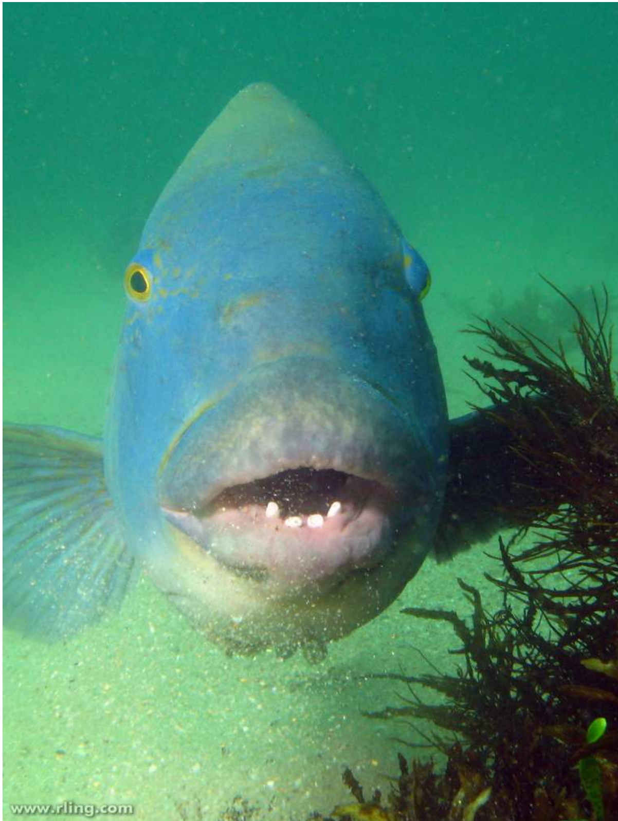
Figure 2. Male Eastern Blue Groper ( Achoerodus viridis) at Manly NSW.