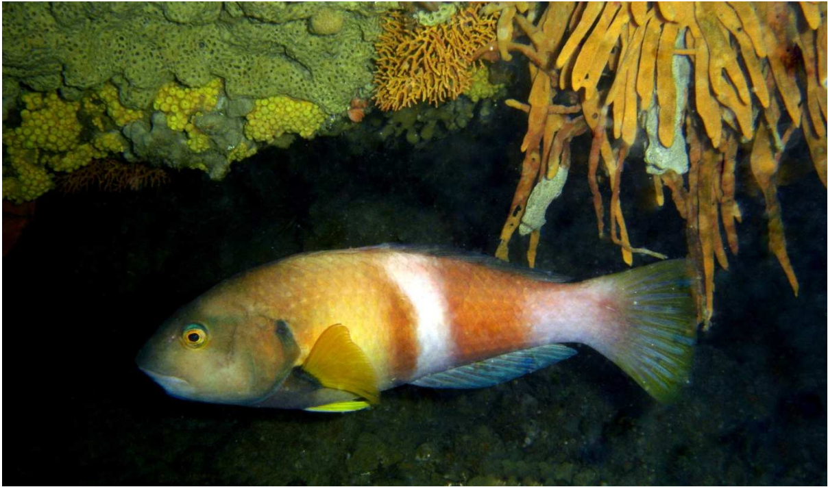
Figure 3. Bluethroat Wrasse or Blue Head ( Notolabrus tetricus) at Swan Bay, Victoria.