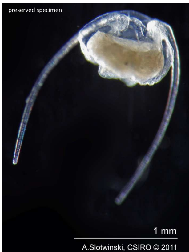
A. Slotwinski, CSIRO © 2011

(Full reference available at http://www.imas.utas.edu.au/zooplankton/references )